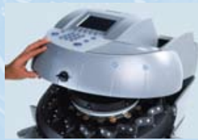
Inside the SC Active 2200 is the advanced software and superior sensors necessary to track each coin individually, identify the correct outlet and deposit it there - all in split second.