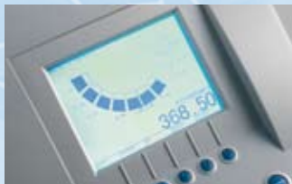
Clear display: Screen format can be easily adapted to show just the information you require.

When a traditional sorter stops for a bag switch, productivity falls by 100%. With the SC Active 2200, productivity falls some 10% – coins re-circulate and the other eight bags operate as normal. A new bag is attached and productivity returns to 100% without interruption.