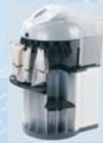
Adjust to size: The machine can be adjusted to suit the size of your packaging solution.