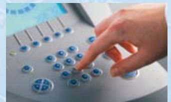
Take control: Software-controlled function keys make operation easy.

For example, the machine can sort national currency denominations to 8 outlets and a foreign currency denomination to the ninth. In fact, you can allocate any denomination to any bag and each denomination can be allocated to several bags.